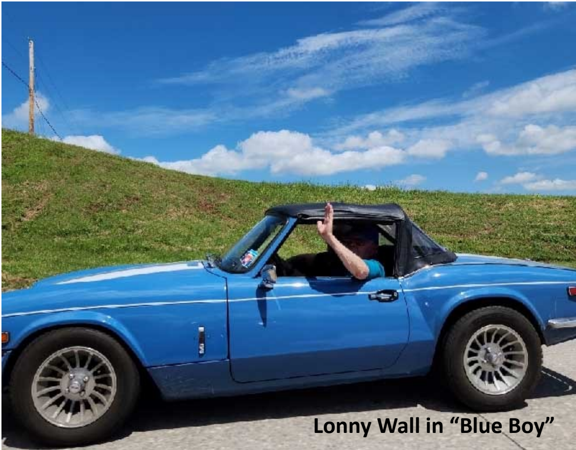
Lonny Wall in “Blue Boy”